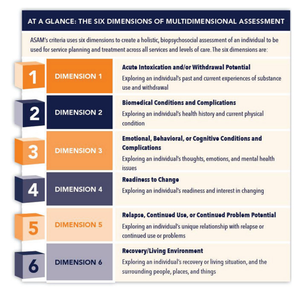
FIGURE 1 | The ASAM Criteria

Despite multiple clear guidelines, the vast majority of Americans with addiction do not receive treatment inclusive of best practices, including MOUD. Many programs rely on abstinence-based treatment, which requires patients to forgo evidence-based medications