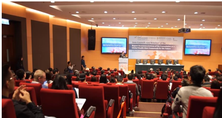
The Asia-Pacific launch of the Global Health Risk Framework report was held at the University of Hong Kong on March 13.

Vaccine International Forum: On May 15-16, NAM co-organized an international forum for high-level R&D stakeholders to advance the discussion on accelerating the availability of new vaccines for infectious disease threats and to build on the GHRF R&D recommendations.