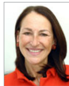
NAM FOREIGN SECRETARY Margaret A. (Peggy) Hamburg, M.D. Former Commissioner of Food and Drugs, U.S. Food and Drug Administration