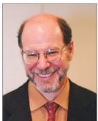
H. Robert Horvitz, Ph.D. Investigator, Howard Hughes Medical Institute; and Professor of Biology, Massachusetts Institute of Technology